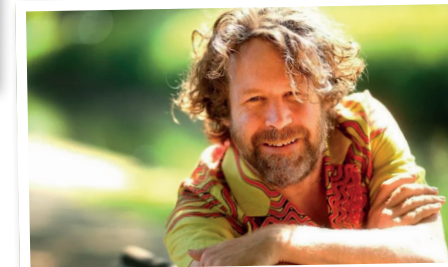
Liam Ó Maonlaí from Hothouse Flowers + White Sail Sat 2 Oct 7pm, £18 Tyneside Irish Centre Doors open 7pm Support - 7.30pm Main act 8.15pm