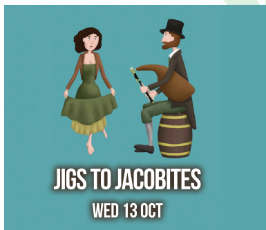
JIGS TO JACOBITES