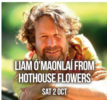
LIAM Ó'MAONLAÍ FROM HOTOHOUSE FLOWERS